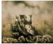
Ohne andere Gesellschaft ["Without Other Society"] 1964 Oil on canvas Signed on recto 25 1/2 x 32 inches (65 x 81 cm) #129 (OELZ 24)