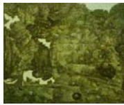
Kleiner Park ["Small Park"] 1953 Oil on masonite Signed on recto 11 x 13 1/4 inches (28 x 35 cm) #48 (OELZ 6)