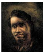
Imaginäres Porträt ["Imaginary Portrait"] ca. 1954 Oil on paperboard Signed on recto 20 x 16 3/4 inches (51 x 42.5 cm) #49 (OELZ 7)