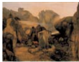
Landschaft mit Kapelle ["Landscape with Chapel"] 1947 Oil on paperboard Signed on recto 19 1/4 x 25 1/2 inches (49 x 65 cm) #24 (OELZ 5)