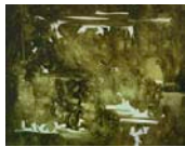
Sanssouci I ["Carefree I"] ca. 1955 Oil on canvas Signed on recto 19 3/4 x 25 1/2 inches (50 x 65 cm) #60 (OELZ 10)