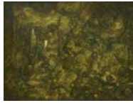
Urwaldkirche ["Jungle Church"] 1959 Oil on masonite Signed on verso 9 1/2 x 12 1/2 inches (24 x 32 cm) #96 (OELZ 15)