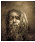
Alter ["Old Age"] ca. 1954 Oil on paperboard 20 x 16 3/4 inches (51 x 42.5 cm) #50 (OELZ 8)