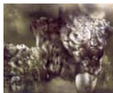
Einsamer Wunsch ["Lonely Desire"] 1967 Oil on canvas Signed on recto 31 1/2 x 39 1/2 inches (80 x 100 cm) #143 (OELZ 25)