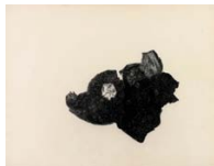
Studie [Study] ca. 1968 Black chalk on paper 19 x 24 2/3 inches (48.5 x 62.5 cm) #S73 (OELZ 44)