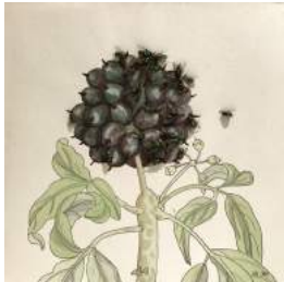
Heide Hatry Lucilia sericata II 2019 Hand colored (blue) early 19th century print and green flies in shadow box 6 x 6 inches (15.2 x 15.2 cm) (HHAT 31)