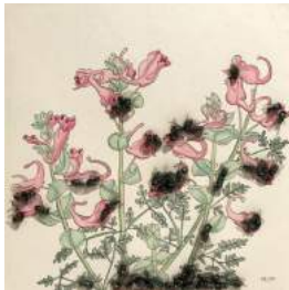
Heide Hatry Lucilia sericata I 2019 Hand colored (red) early 19th century flower print and green flies in shadowbox 6 x 6 inches (15.2 x 15.2 cm) (HHAT 30)