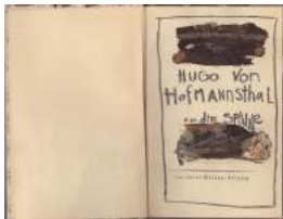
Heide Hatry Die Spinne ["The Spider"] Unique artist's book. Text by Hugo von Hofmannsthal. Decorated paper covered boards, 24 pages 2013 Mixed media with found insects 7 1/4 x 7 7/8 inches (18.4 x 20 cm) (HHAT 32)