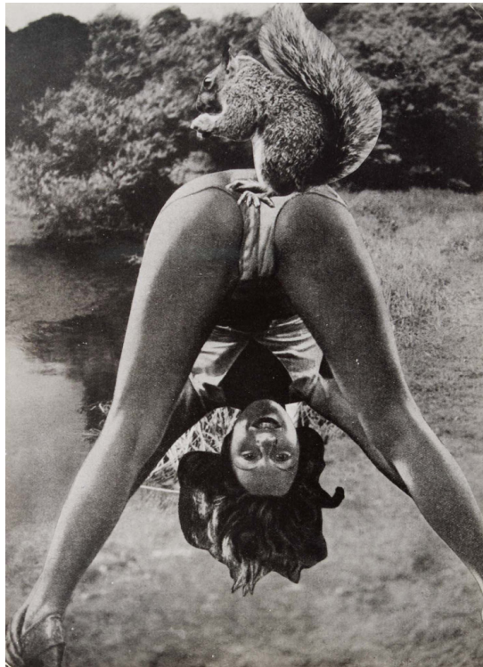
Georges Hugnet Notre amie, de très haute lignée polonaise... ["Our friend, of very high Polish I..."]