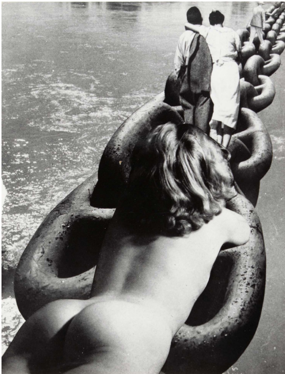
Georges Hugnet La promenade du soir... ["The evening walk..."] From Huit jours à Trébaumec ["Eight days..."]

JUNE 23, 2016 - UNITED STATES , WRITTEN BY L'OEIL DE LA PHOTOGRAPHIE