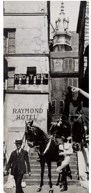
Georges Hugnet Nous décidons de partir pour Trébaumec... ["We decide to depart for Tréba..."]